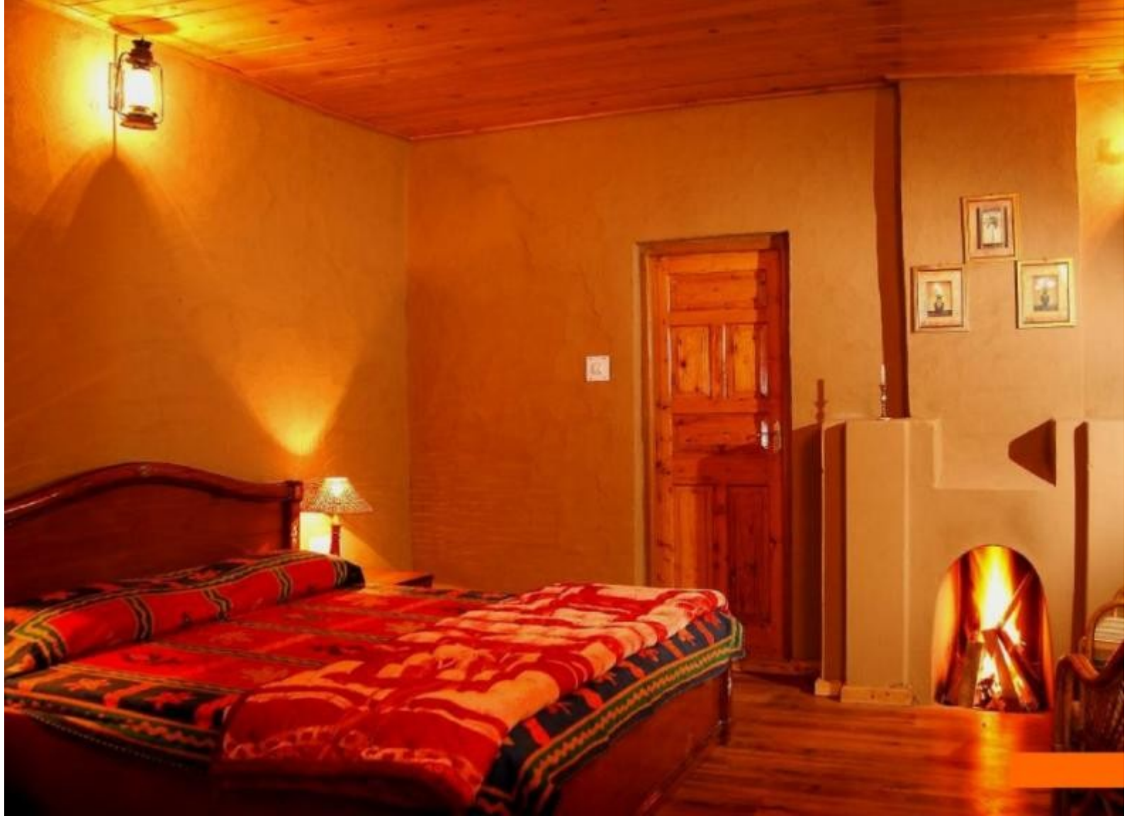
Mud Cottage Interior